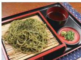
Green tea soba (buckwheat noodles)