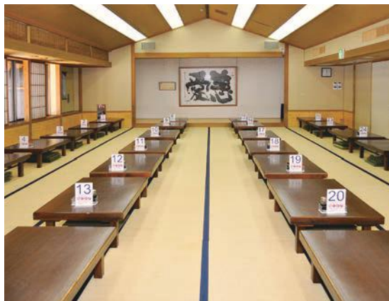
Dining area (free rest area)

This is a large dining and free resting area measuring 80 tatami mats in size. Tuna on rice and green tea soba (buckwheat noodle) are recommended since Shizuoka is famous for green tea.