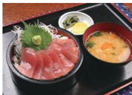
Tuna on rice

This is a large dining and free resting area measuring 80 tatami mats in size. Tuna on rice and green tea soba (buckwheat noodle) are recommended since Shizuoka is famous for green tea.