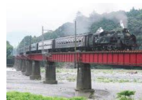
The view from Kawane Hot Spring