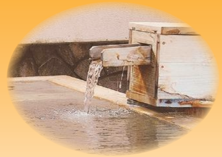
Continuous Flow Natural Hot Spring Outdoor Hot Spring Bath with View of Steam Locomotive