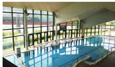
20 Meter Hot Spring Pool

Enjoy the 20 meter swimming pool, various types of sauna and hot springs.