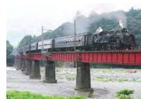
The view from Kawane Hot Spring