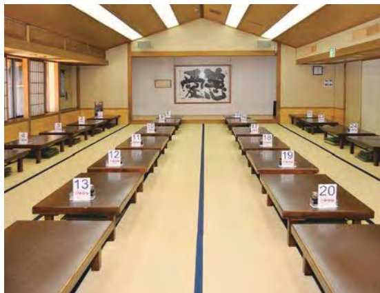
Dining area (free rest area)

This is a large dining and free resting area measuring 80 tatami mats in size. Tuna on rice and green tea soba (buckwheat noodle) are recommended since Shizuoka is famous for green tea.