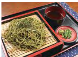
Green tea soba (buckwheat noodles)