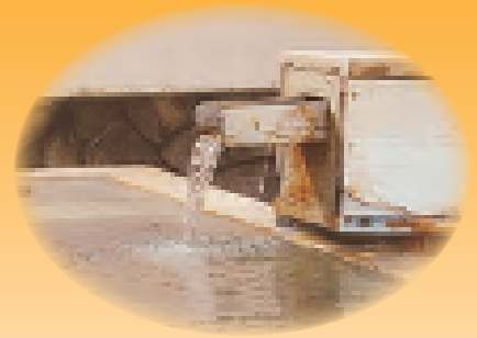
Continuous Flow Natural Hot Spring Outdoor Hot Spring Bath with View of Steam Locomotive