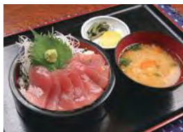
Tuna on rice

This is a large dining and free resting area measuring 80 tatami mats in size. Tuna on rice and green tea soba (buckwheat noodle) are recommended since Shizuoka is famous for green tea.