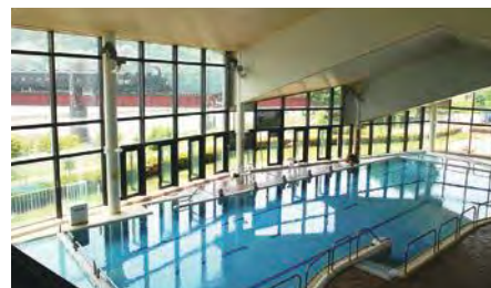
20 Meter Hot Spring Pool

Enjoy the 20 meter swimming pool, various types of sauna and hot springs.